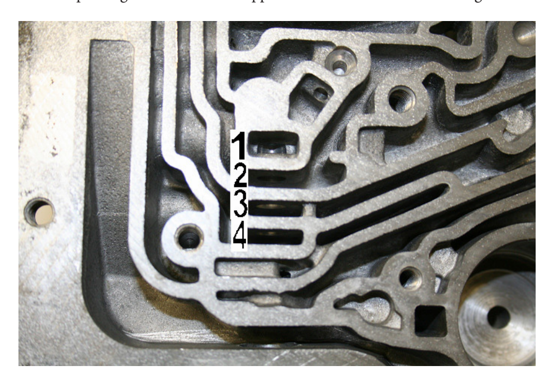
Brake On: Lands 3 & 4 are connected. Brake Off: Lands 2 & 3 are connected. Ensure solenoid plunger bottoms on solenoid back when stroked. Shims on bracket bolt may be needed when there is a shim on the solenoid.

Check valve phasing when solenoid is applied and released. Refer to the figure below.